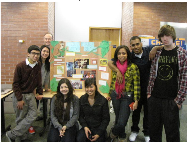
the University of Toronto

In December of 2010, the Jane Goodall Institute of Canada and Jane Goodall's Roots & Shoots initiated a Southern Ontario-wide outreach and education program with the goal of engaging more Canadian youth than ever before. Over the past three months, our outreach staff has been hitting the road daily to speak to thousands of young Canadians. Sharing a message of hope from the Jane Goodall Institute, we've visited schools in Toronto, Halton Region, Simcoe County and York Region. The team has already presented to over 2,000 students and that is just the start! We share Dr. Jane's incredible story, introduce young people to our closest animal relative, the chimpanzee, and educate students about the plight of endangered species. We look forward to expanding the program to reach and inspire youth from all over the country. Want our outreach team to come to your area? Contact us today, email roots_shoots@janegoodall.ca