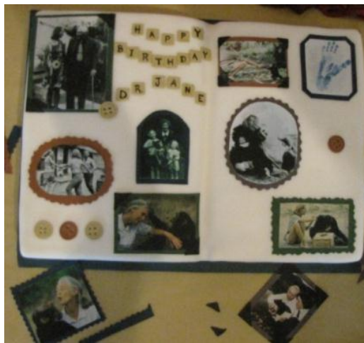
The amazing birthday cake scrapbook! Donated by For the Love of Cake

Our dedicated volunteers were out in full force on April 3 rd to help celebrate Dr. Goodall's 77 th birthday . She was treated to a fantastic birthday cake scrapbook complete with photos from her past as well as a special serenade performed by our talented Youth Leadership Council.