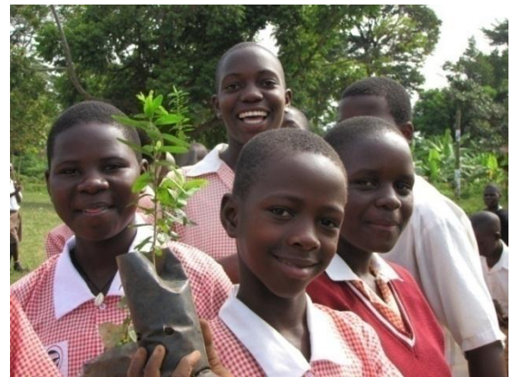
Local school children and our partners in Uganda.