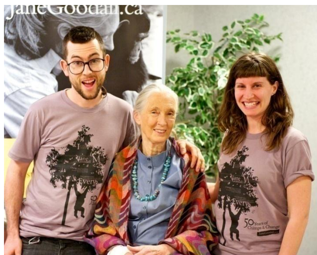
Two of our fabulous (and thrilled!) volunteers in Halifax.

An audience of almost 800 joined Dr. Goodall in an exclusive engagement at the ROM, co-presented by the Schad Gallery of Biodiversity, as we wrapped up the 50th anniversary celebrations of her pioneering research. Then it was off to Halifax - for the first time ever - where Dr. Goodall spoke at the Halifax Chamber of Commerce Spring Dinner and also swung by the Discovery Centre to connect with local youth and inspire participation in the Roots & Shoots program. Check our website, JaneGoodall.ca , for more photos from the tour.