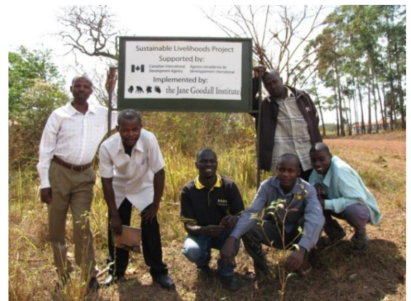
Our partners in Uganda.